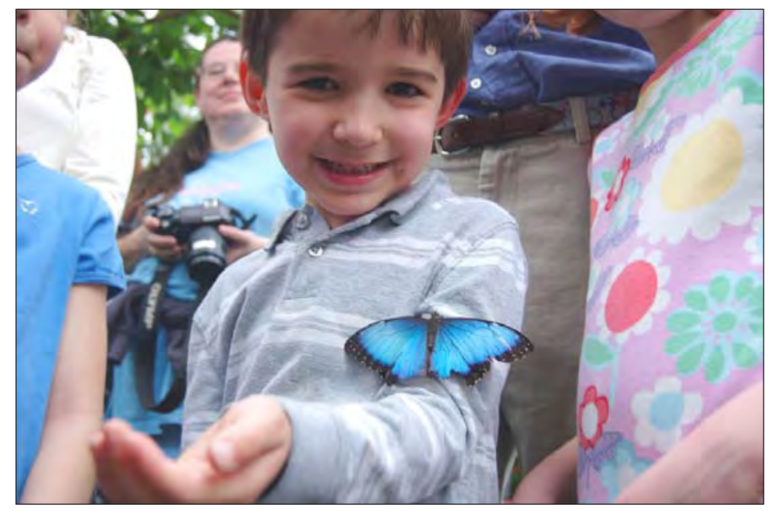
MARCH MORPHO MANIA Tuesdays-Sundays in March 9 a.m.-4 p.m. Butterfly House, Faust Park $6 adults, $4 children (3-12)

The Butterfly House obtains its Blue Morphos from the El Bosque Nuevo butterfly farming operation in Costa Rica. The butterfly farm provides locals income and allows for the restoration of native habitat, increasing the potential for species