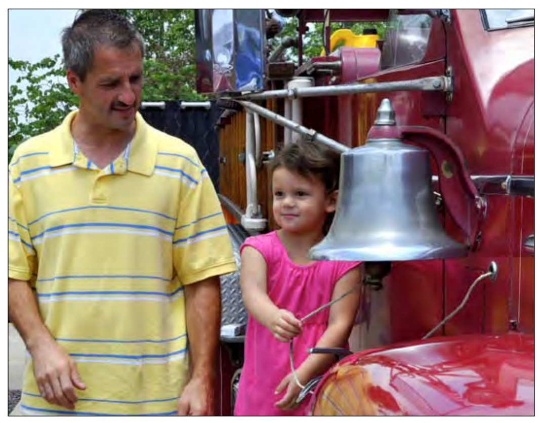
Kids can ring in the fun at Kemp Auto Museum's Big Truck Day June 10 on the plaza from 10 a.m. to 3 p.m.